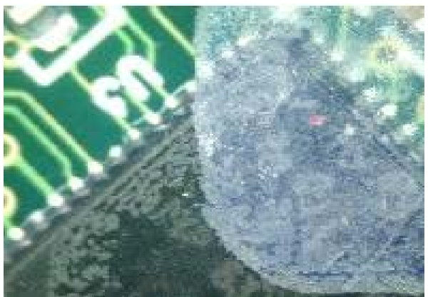
Release agents causing delamination/adhesion issue

There are many release agents used in board and component manufacturing. Some are incompatible with coating, so may cause dewetting or delamination.